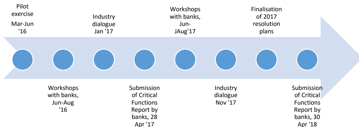
Figure 3: Identifying critical functions – overview of the timeline